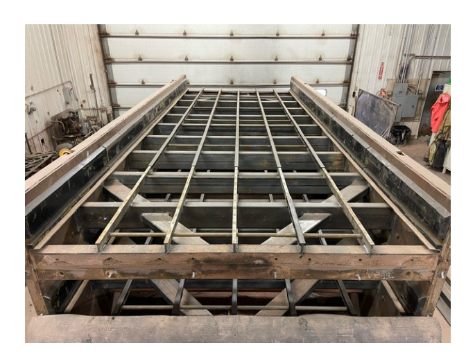
East Sioux Quarry 8'x20' Diester screen rebuild and ready for the production season.

Even with careful planning not every task goes exactly as planned. Last time I checked, crystal balls were still out of stock on Amazon. But if we plan for the foreseen, the unforeseen becomes a little less burdensome when they pop up.